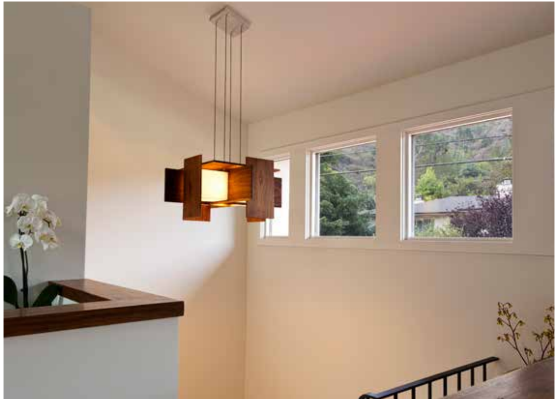
walnut, above and below