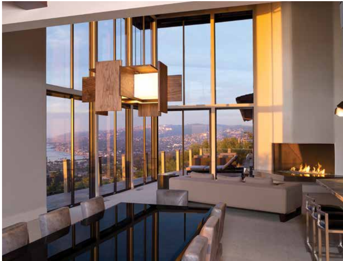
Non-pictured finish option