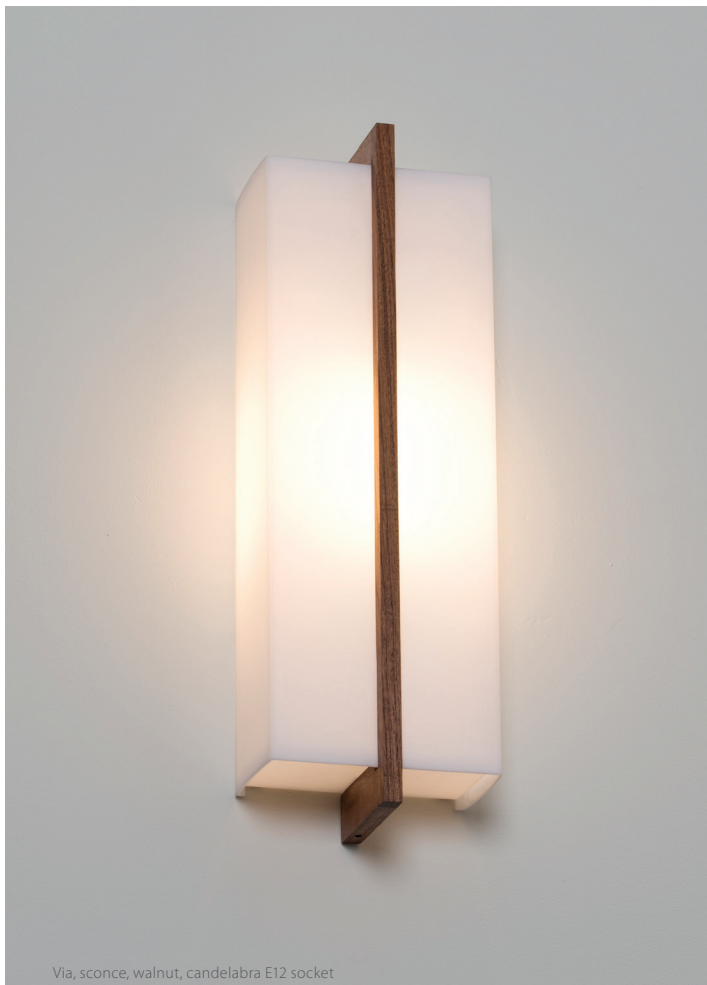
Via, sconce, walnut, candelabra E12 socket