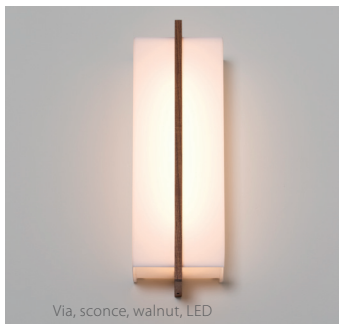
Via, sconce, walnut, LED