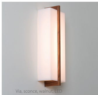
Via, sconce, walnut, LED